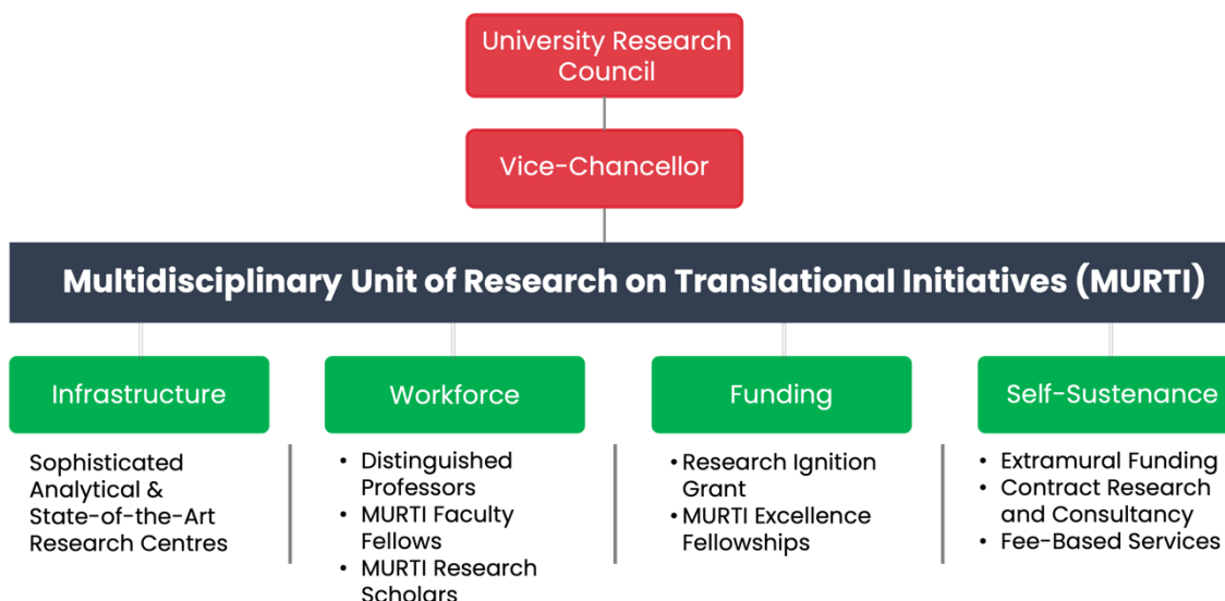
Figure 1: Framework of MURTI

To achieve this, MURTI centres will be set up across all campuses of GITAM University. These centres will involve top-quality faculty from diverse disciplines, either from GITAM's talent pool or invited from established national/global institutions, who will be associated with MURTI. By bringing together researchers from various fields onto a common platform, MURTI aims to create an intellectually stimulating research environment, breaking away from the traditional approach of looking at problems solely through a single discipline.