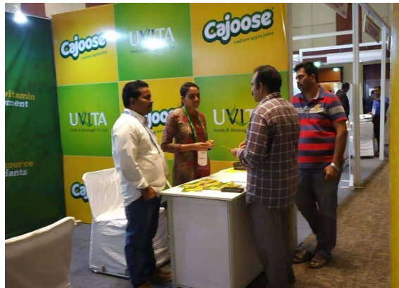
Cashew Apple Juice branded as Cajoose – a flagship product of UVITA Foods & Beverages Pvt. Ltd.