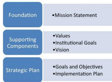
Figure 1 Components of the 15 year Strategic Vision Plan