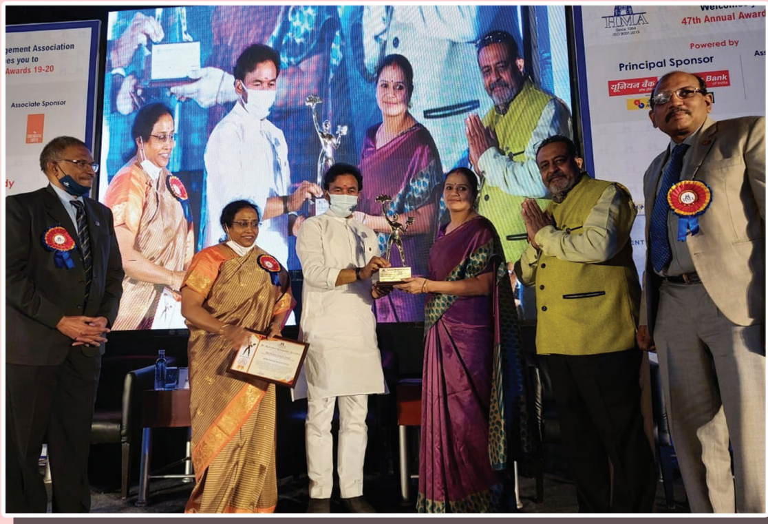
GITAM Hyderabad Business School received "The Best Student Chapter Award" from Shri. G. Kishan Reddy, Hon'ble Union Minister