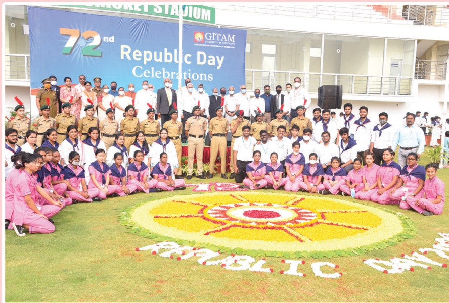
Republic Day Celebrations on 26 th January 2021