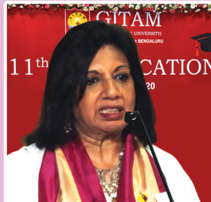
Ms. Kiran Mazumdar Shaw, CMD, Biocon addressing at the 11 th e-Convocation