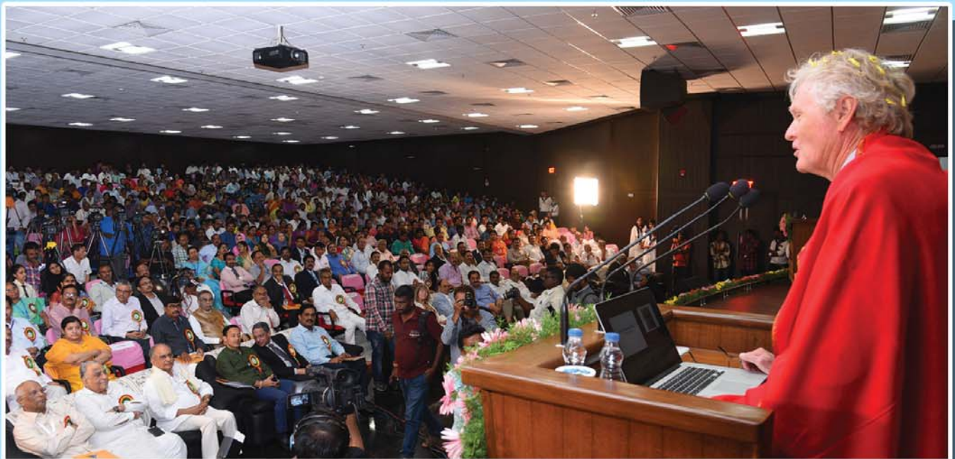
Dr. Michael W. Young, Nobel Laureate, Rockefeller University, NY, USA addressing at 38 th Foundation Day Celebrations at GITAM Visakhapatnam