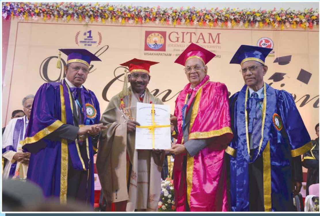
Dr. K. Sivan, Secretary, DoS, Chairman, ISRO being conferred Honorary Degree of Doctor of Science (D.Sc.) at GITAM Hyderabad Convocation